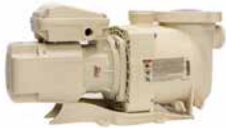
SuperFlo High Performance Pump