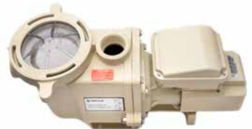
WhisperFlo High Performance Pump

These pumps are the result of our 40 years delivering superior performance and earning the industry's critical acclaim.