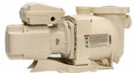
SuperFlo High Performance Pump