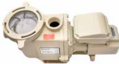
WhisperFlo High Performance Pump